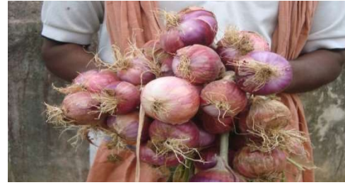
OFT on onion varieties during kharif