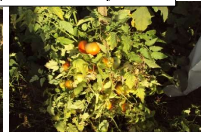
OFT on Tomato var. Swarna Sampad