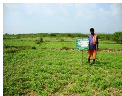
OFT on INM in sesamum