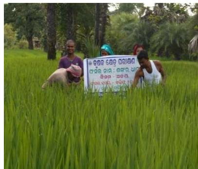
OFT on hybrid rice var. Ajaya