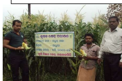
OFT on sweet corn var. Madhuri