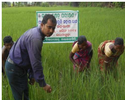
OFT on drought tolerant rice var. Sahabgadh

38. Well labeled Photographs for each activity of the KVK (Soft copies as well as hard copy- specially for all OFT along with the problem) –